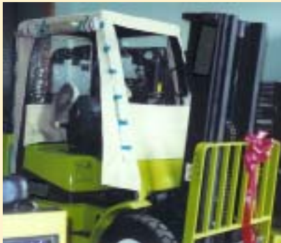
Cab cover open