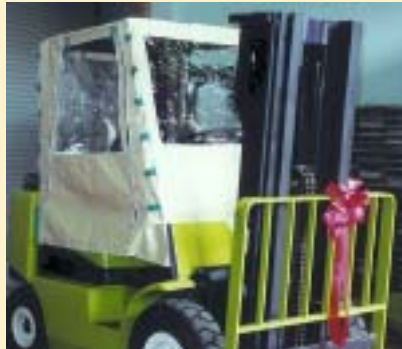
Cab cover closed